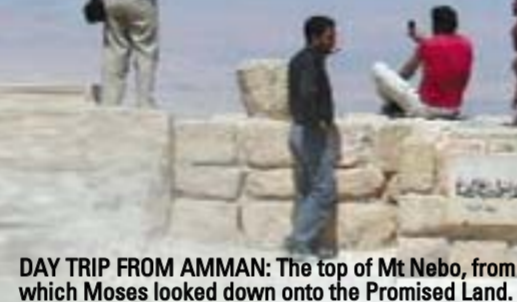
DAY TRIP FROM AMMAN: The top of Mt Nebo, from which Moses looked down onto the Promised Land.

Truly, if there was any nation where I needed a regular