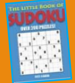
THIS PUZZLE IS EXTRACTED FROM THE LITTLE BOOK OF SUDOKU 2005. REPRODUCED WITH THE PERMISSION OF MICHAEL O'MARA BOOKS LTD.

What are your views on Sudoku Plus? Email us at plus@newstoday.com.sg