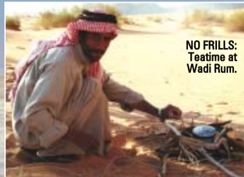
NO FRILLS: Teatime at Wadi Rum.

In Bangkok, for example, I stay at the minimalist Metropolitan Hotel yet prefer eating outside the swanky property on the gritty streets, at a wobbly table together with hookers, truckers